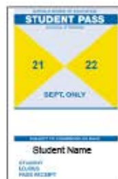
Buffalo Public Schools SEPT. ONLY PASS