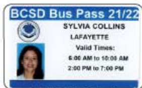
Buffalo Public Schools BASIC PASS