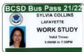
Buffalo Public Schools - WORK STUDY PASS