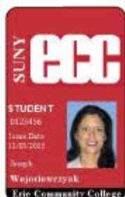
Erie Community College Students