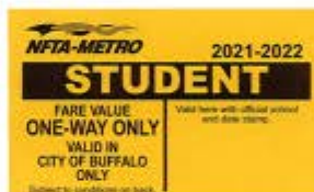
Buffalo Public Schools ONE WAY PASS