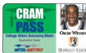
Buffalo State Undergraduate Students