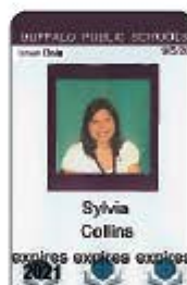
Buffalo Public Schools SCHOOL SECURITY