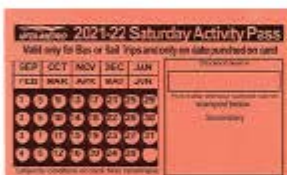
Buffalo Public Schools SATURDAY PASS