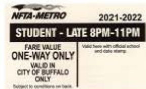
Buffalo Public Schools LATE PASS