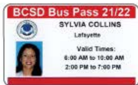
Buffalo Public Schools RESTRICTED PASS